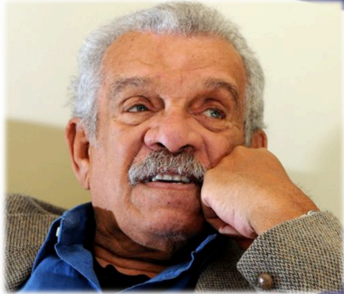
~ Derek Walcott